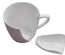
Broken Glass & Dishes (Please Wrap)