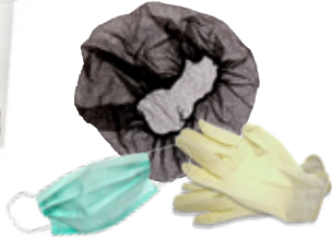
Disposable Gloves & Hairnets