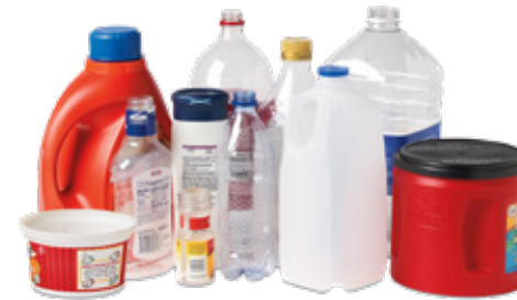
Empty Plastic Bottles, Rigid Plastic Containers (Lids should be left on or placed in trash)