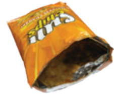
Snack & Chip Bags, Candy Wrappers

UPDATED: Coated paper (with surface sheen) such as cups, plates or cardboard boxes, belong in trash only. (Paper beverage cartons may go into recycling)