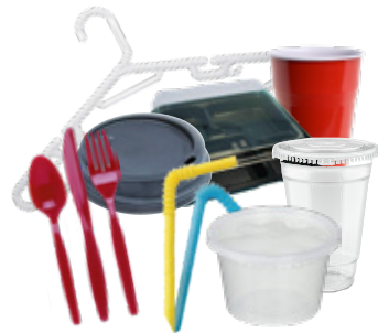
Plastic Cups & Lids, Utensils, Straws, Clam Shells, Deli Containers & Hangers (Including "compostable" plastic serveware)