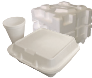
Polystyrene Foam & Packaging