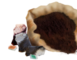
Coffee Grounds & Tea Bags