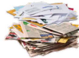
Clean Paper, Magazines, Newspaper, Cardboard, Junk Mail, Paper Beverage Cartons (no other coated paper items)

Please empty all containers prior to recycling. Do not bag recyclables.