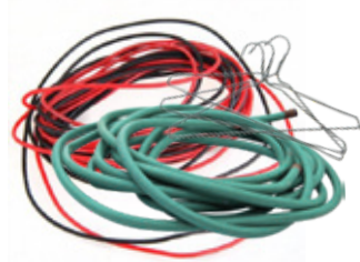
Hoses, Cords & Wire (Electrical wires are e-waste. Refer to Hazardous Waste Disposal Information)