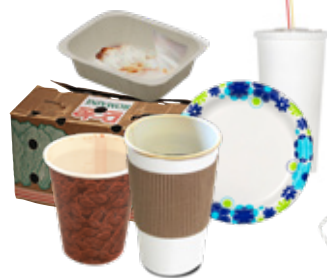
Coated Paper Cups/Plates, To Go Containers, Wax-lined Food Cardboard Boxes