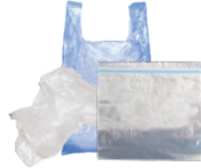
Plastic Wrap, Bags & Other Plastic Film