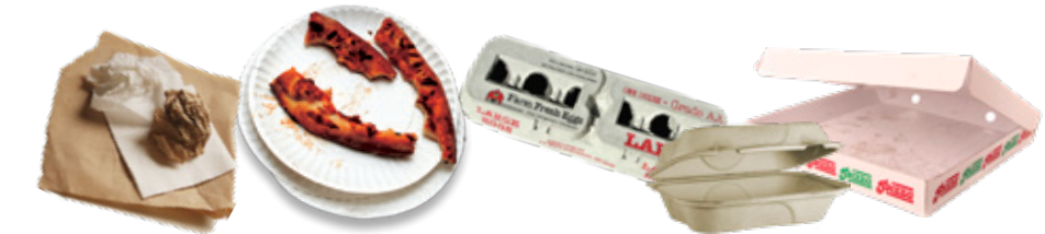
Food Soiled Paper, Napkins, Paper Towels, Pizza Boxes, Cardboard Egg Cartons, Non-coated Take-out Containers & Paper Plates (No surface sheen)