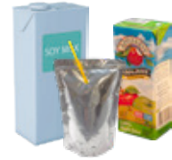
Asceptic (Mixed Material) Drink & Beverage Cartons, Boxes & Drink Pouches